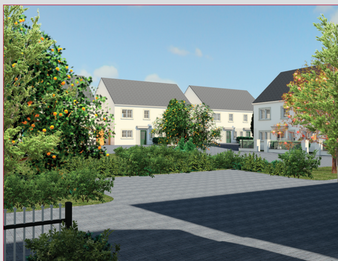
Artist's impression of the Grouville estate

At a small development in Rue du Haut in St Lawrence, the JHT will have four two-bedroom flats and a detached two-bedroom bungalow with its own garden. All the homes will have a car